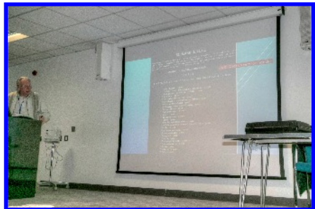
Paul Webmaster with Powerpoint presentation