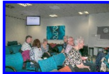
Chat before lunch