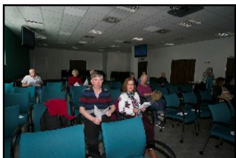
Members settling down and reading the agenda before the meeting starts