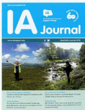
Front Cover: Young IA Committee Member Suzannah demonstrates freedom with an internal pouch.